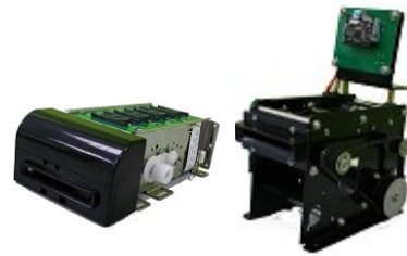
Motorized barcode ticket/smart card acceptor that provides reliable and speedy ticket/card handling.