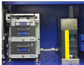
Combination of note dispenser and hopper or 2 notes or 4 notes (Optional)