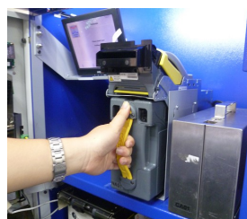
Swappable cartridge design for conveniences in banknote handling.

Copyright © 2004 - 2015 Evoxen Sdn Bhd. All rights reserved. V7