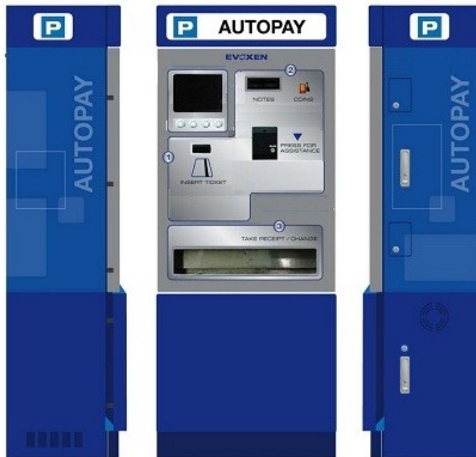
Logical Layout diagram for APS

EVOXEN ® EVOLUTIONARY EXCELLENCE ENCLOSED