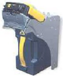
World class standard note acceptor Cartridges (1,200 notes per Cartridge). (Standard)

With its highly practical, affordable in maintaining and low operating cost, F8060 enables maximizing of profits. Collection logic can be configured with ease without any programmatic dependence on vendor. The F8050 is the parking equipment that will enable your business to enjoy unattended collection 24 hours x 365 days.