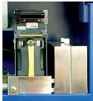
Second level security to prevent easy access to cash storages.